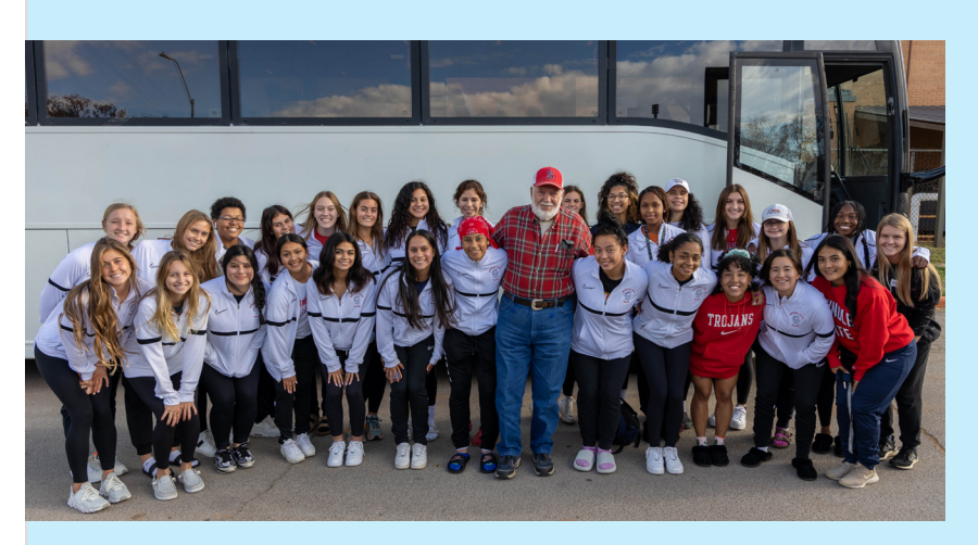
The women's soccer team poses in front of the bus before making their departure on Nov. 12 for the NJCAA Division I National Tournament.

The Seminole State College women's soccer team placed in the top four at the NJCAA Division I National Tournament in Daytona Beach, Florida. The competition was held from Nov. 15-20 at Daytona State College. They entered the tournament as the number two seed.