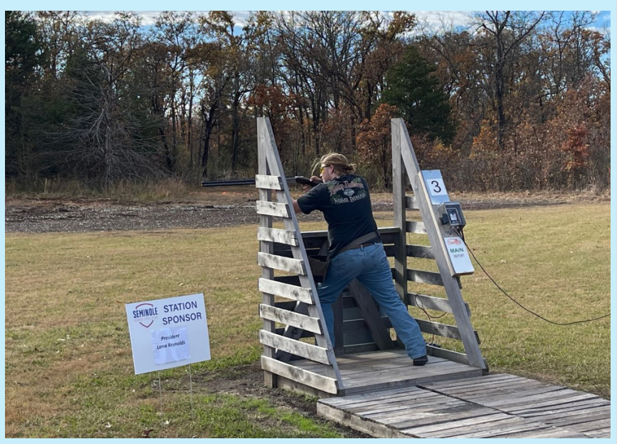
A participant at the SSC Shooting Sports Club fundraiser tournament takes aim at a clay pigeon on Nov. 12.

The Seminole State College Shooting Sports Club hosted a fundraiser tournament at Clay Bird Sports in Bethel Acres on Nov. 12. The student club was established this year, and this event marked their first tournament. More than 50 participants competed at the event—including high school teams as well as adults. The proceeds of from the fundraiser will help the club practice weekly and compete in regional and national shoots.